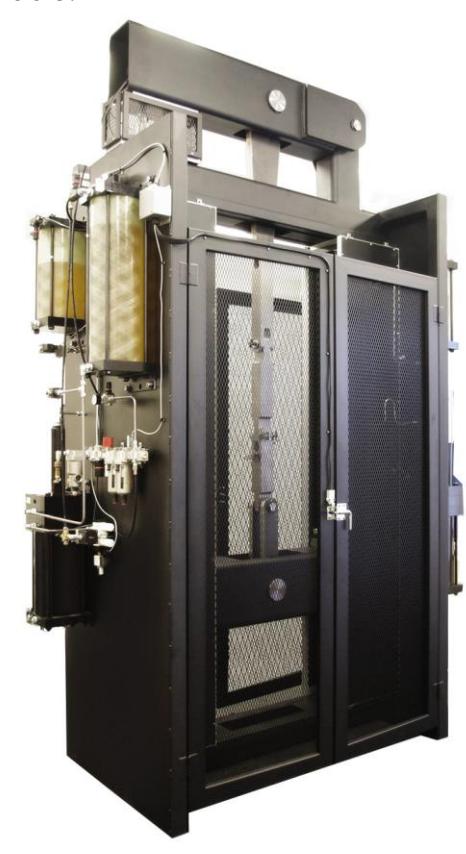
Figure 1: Tow and Cargo Hook Test Stand, As Delivered